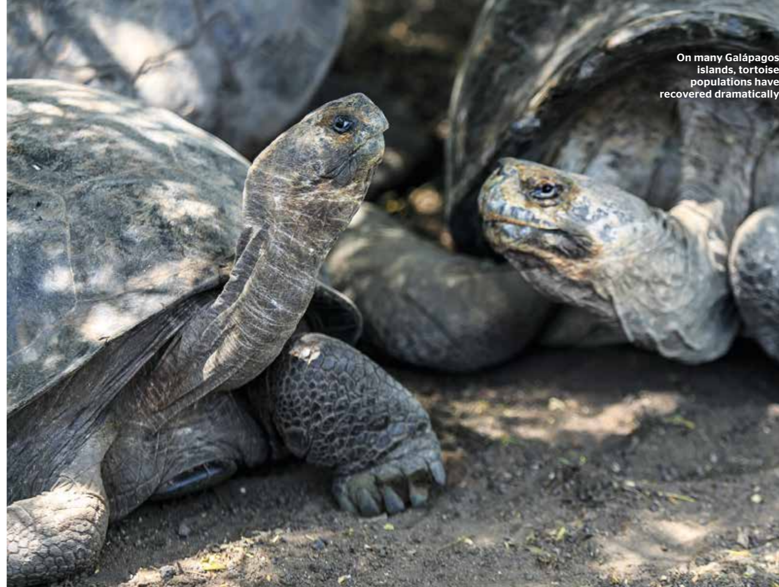
On many Galápagos islands, tortoise populations have recovered dramatically

rose above the rest to become almost as much of a Galápagos Islands celebrity as Charles Darwin himself. This individual was the last remaining Isla Pinta tortoise, a subspecies thought to have long since gone extinct. In a mind-bending exercise in contemplating true loneliness, it is believed that he was spotted in 1906, when researchers from the California Academy of Sciences arrived on Isla Pinta to remove three fellow tortoises, but since he was in too difficult a location for them to reach, they left him behind.