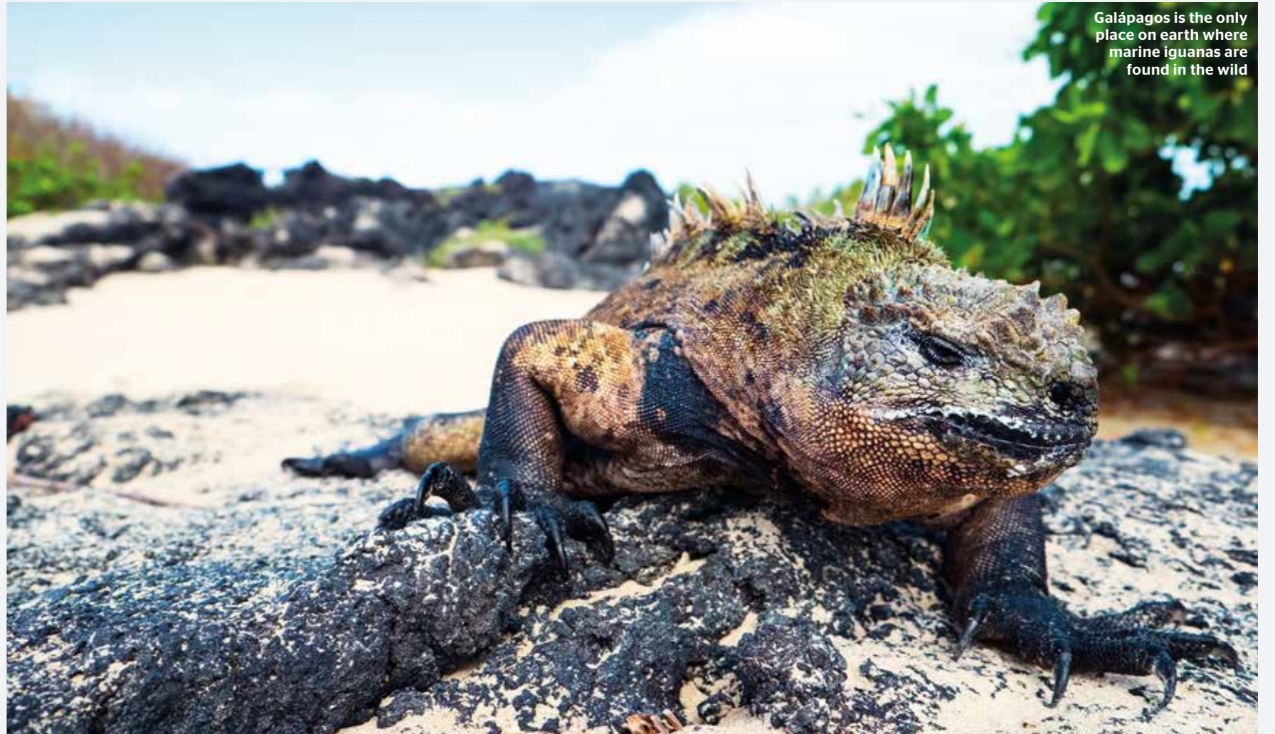
Galápagos is the only place on earth where marine iguanas are found in the wild

■ Aside from the Galápagos’ most famous residents – the giant tortoises – the islands are also home to the world’s only marine iguanas. They can be primarily seen lazing around in the sun sneezing excess salt everywhere, or occasionally diving into the water – they are excellent swimmers – in search of a meal, nibbling marine algae off submerged rocks. The islands are also home to land iguanas, including a bright pink species classified for the first time in 2009, after being located in a remote part of Wolf Volcano. Sharing the rocky coastlines with the marine iguanas are Galápagos penguins, the only penguin that lives at or near the equator. The roughly 2,000-strong bird population is mainly located in the colder, nutrient-rich waters of Fernandina and Isabela, and this small population size and restricted range means they are graded as ‘endangered’ by the IUCN. Further out to sea, the islands are also a hub of utmost importance for over 2,900 marine species, including sea lions and turtles. To the far north, the remote uninhabited Wolf and Darwin islands witness vast gatherings of hammerheads and even whale sharks, whose presence helped establish the Galápagos Marine Reserve in 1986, now – at 133,000 square km – one of the largest such reserves in the world.