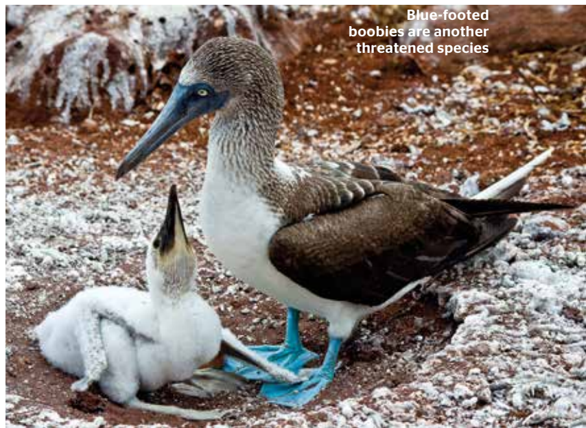
Blue-footed boobies are another threatened species

There is one case study which dares bring hope to the hearts and minds of conservationists battling such problems: the Australian ladybug. These insects were intentionally introduced in 1999 to control the spread of the cottony cushion scale, an invasive insect which threatened over 90 plant species. Twenty years of research suggests that it has been successful. 'They had to do so many [post-introduction] studies to ensure