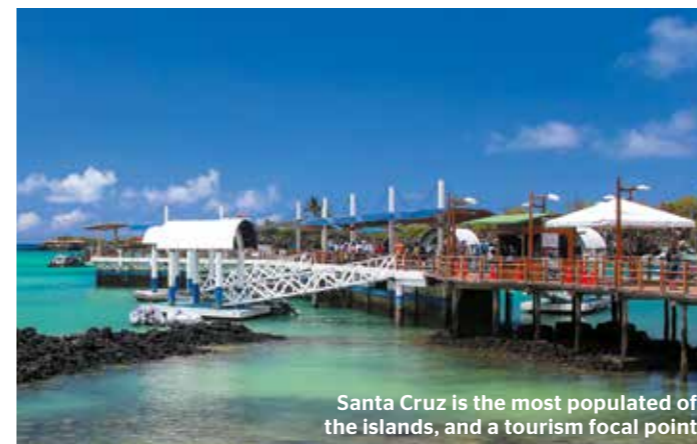
Santa Cruz is the most populated of the islands, and a tourism focal point

But the islands weren’t always seen for this scientific importance. Initially, they were well-known primarily for their rugged and abrasive image. Even the man who famously changed the hostile reputation of the Galápagos, simultaneously going on to revolutionise not just biological science, but much of the modern world, wasn’t entirely enamoured with their aesthetics.